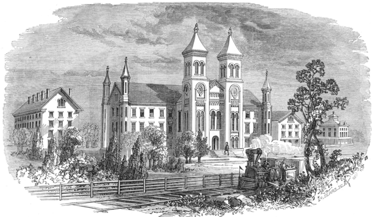
Antioch College, Yellow Springs, Ohio.